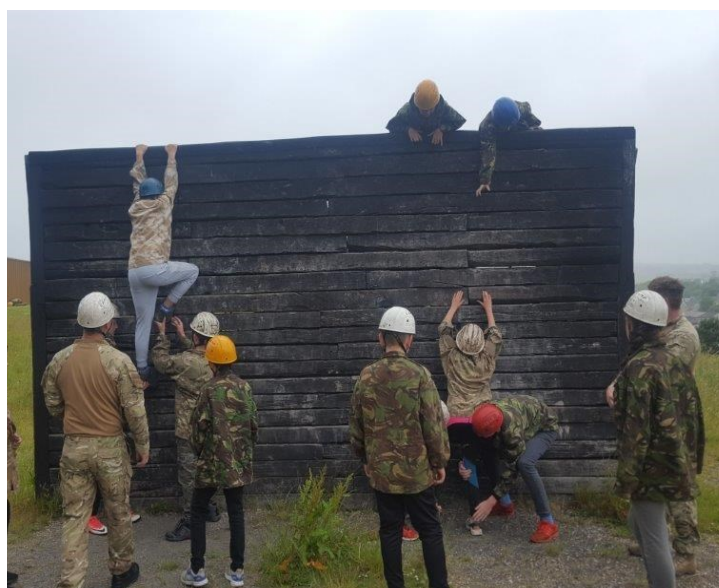
A community integration project in Wales supporting young people from Armed Forces and civilian communities to work together

You don't have to replicate these projects. We are interested to hear your ideas to address need in your community.