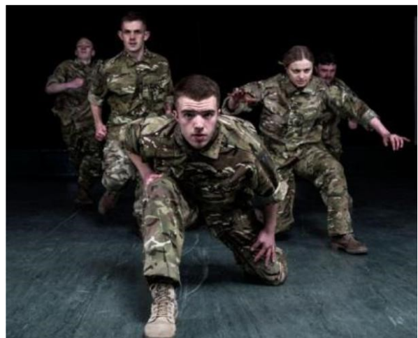
5 Soldiers- The Body is the Frontline: a community integration grant