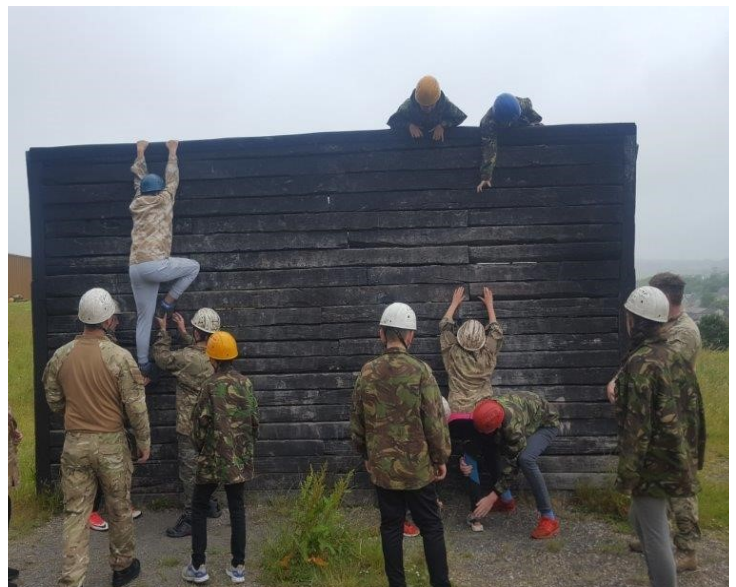
A community integration project in Wales supporting young people from Armed Forces and civilian communities to work together

You don't have to replicate these projects. We are interested to hear your ideas to address need in your community.