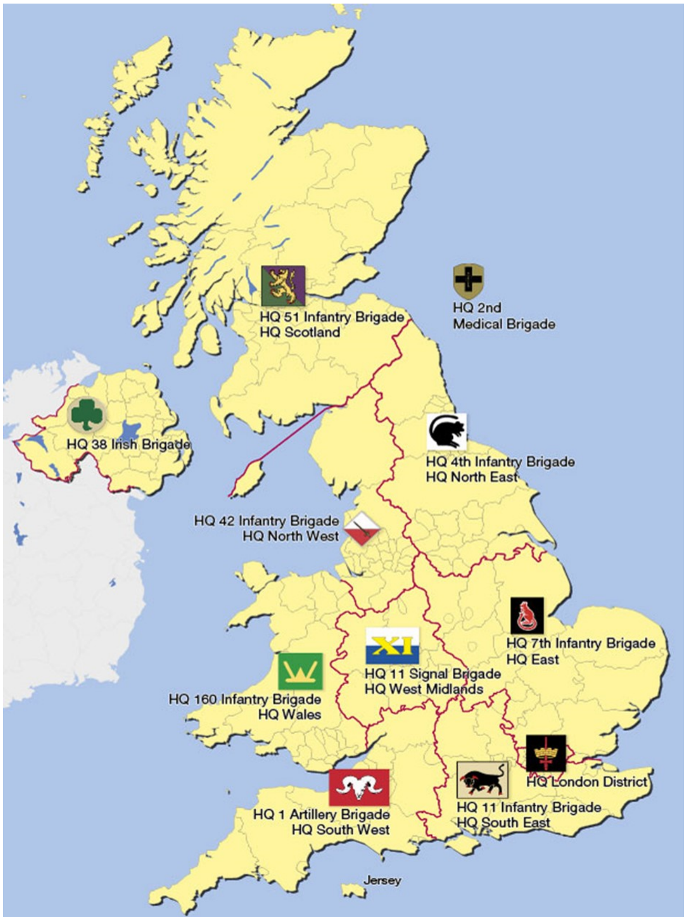
A map of the regions that we use under the Armed Forces Local Grants Programme. You'll need to tell us which region your project is in.