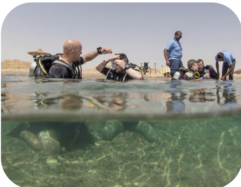
Veterans learning diving skills with Depptherapy

This programme has up to £9M to support activities. Tell us in the consultation about what these activities should be